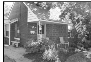
Maternity Home Purchased in 1991