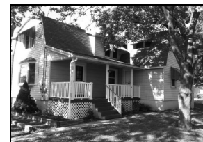
Pat's House Purchased in 2010